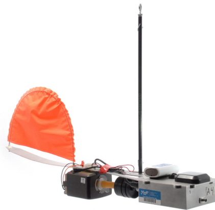
The miniPCS in field configuration. The air containing particles is pulled through the probe volume by the pump at the rear. A removable filter ahead of the pump is used collect particle samples.