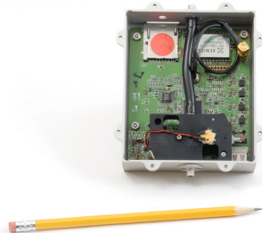
The miniPCS probe includes all the necessary electronics for remote operation and data acquisition.